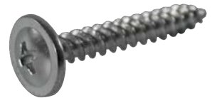
Screw (S09) x 8