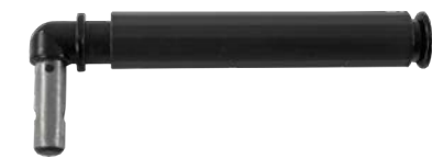
Pole Screw (x2)