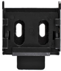
Valance Bracket (VB13) x 3